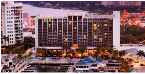
Hyatt Regency in Sarasota, FL

The Hyatt Regency Hotel is located in Sarasota with waterfront dining, pet-friendly rooms with private balconies, and a private marina. From shopping in St. Armands Circle, to outdoor fun at Lido Beach, the best local experiences are just a short shuttle ride away.