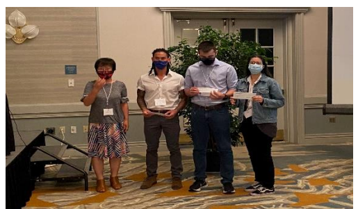
Student awardees at the FSHS 2021

There will also be a student Best Paper competition with awards for the top three presenters (oral and posters). Papers presented at the Annual Meeting will be published in the Proceedings of the FSHS. Manuscripts are due at the time of the presentation.