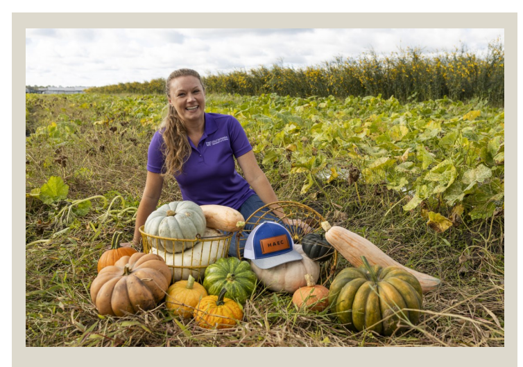
Hastings Agricultural Extension Center — Pumpkin trials

Speaking of industry, one goal that I am passionate about is getting our growers and consultants more involved again. Our society is very affordable and well distributed with the many sections of Florida fruits, vegetables and ornamentals.