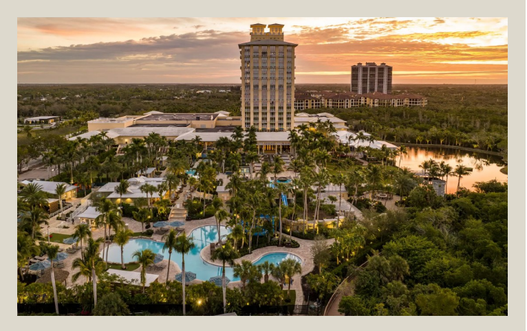
We hope to see you there!

The society will receive titles for oral and poster presentations. This year the annual meeting will take place in a magnificent location in Bonita Springs, FL at the Hyatt Regency <u>Naples Resort Hotel in Bonita</u> <u>Springs | Hyatt Regency Coconut Point</u>