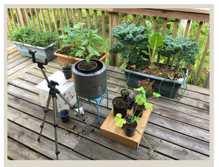
Video set up for Facebook live broadcast

Zoom was the other major platform used during the pandemic. Instead of teaching a gardening class to 20 people in person, I was now able to reach unlimited people online. I taught a Butterfly Gardening Design class hosted by The Florida-Friendly Landscaping<sup>TM</sup> program that had 250 participants.