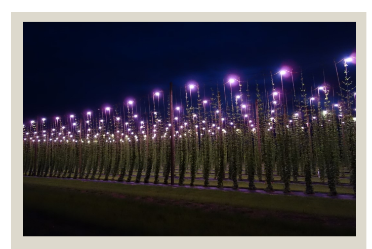
The installation of LED lights in the hop yard to artificially extend day length enabled plants to grow taller and develop many laterals, and allowed control over the timing of flowering.

In 2018, we installed LED lights in the hop yard, so we could artificially extend day length to control the timing of flowering. The photoperiod extension by LED lights enabled plants to grow up to the top of the trellis (19 ft) and developed many laterals. We kept the lights on until plants produced a sufficient amount of bines and laterals. Within a week after the lights were turned off, plants initiated blooming.